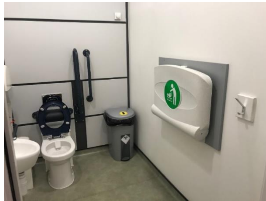
Pictured above: Example of signage and the inside of the room (0.4B in East Building)