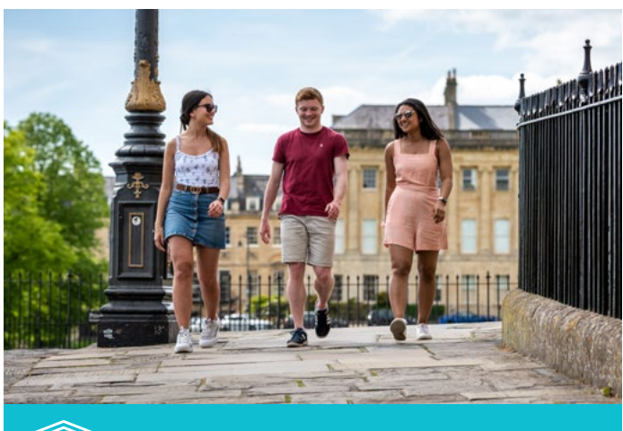
Bath is the only UK city on UNESCO's World Heritage list

Our welcoming campus is safe and friendly, with first-class arts and sports facilities. It provides a real feeling of community for those living, working and studying here. It is one of the safest campus sites in the UK and we are the first university in the country to win a national police approved security award. The campus has excellent places to eat, drink and socialise. Facilities include food shops, post office, and a library open 24/7. The Students' Union forms an important part of the student experience. There are over 100 clubs and societies to get involved in and the union bar and nightclub arranges a variety of events.