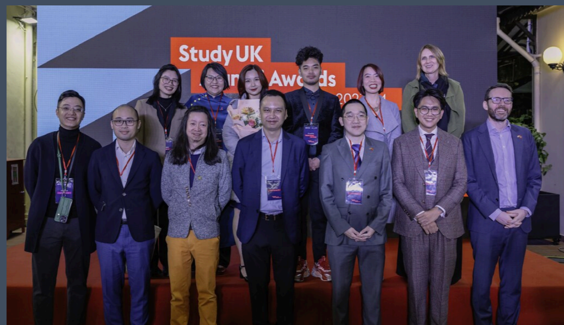
Architecture alumnus wins Study UK Alumni Award 2024 in Vietnam

University of Bath Physics society takes part in the 2024 Oxford Quantum Summit