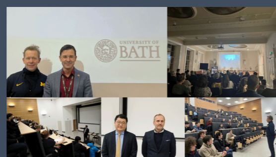
Global Chairs: What have our 2023-24 Global Chairs been up to?

Find student and staff exchange stories, examples of work and research supported by the International Relations Office and celebrations of the University's international successes!