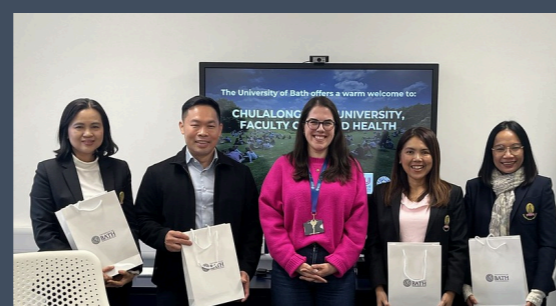
Bath welcomes Thai delegation from Chulalongkorn University