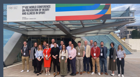
Bath researchers make impact at IOC World Conference on Prevention of Injury and Illness in Sport