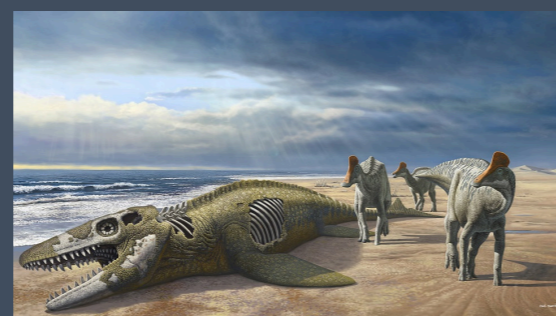
Fossils of giant sea lizard show how our oceans have fundamentally changed since the dinosaur era