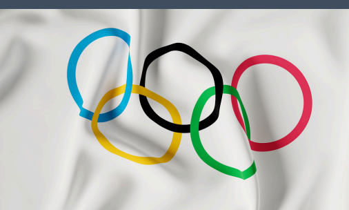
The new IOC Research Centre focusing on athlete health and injury prevention will draw on long-standing sports science research expertise at both institutions.