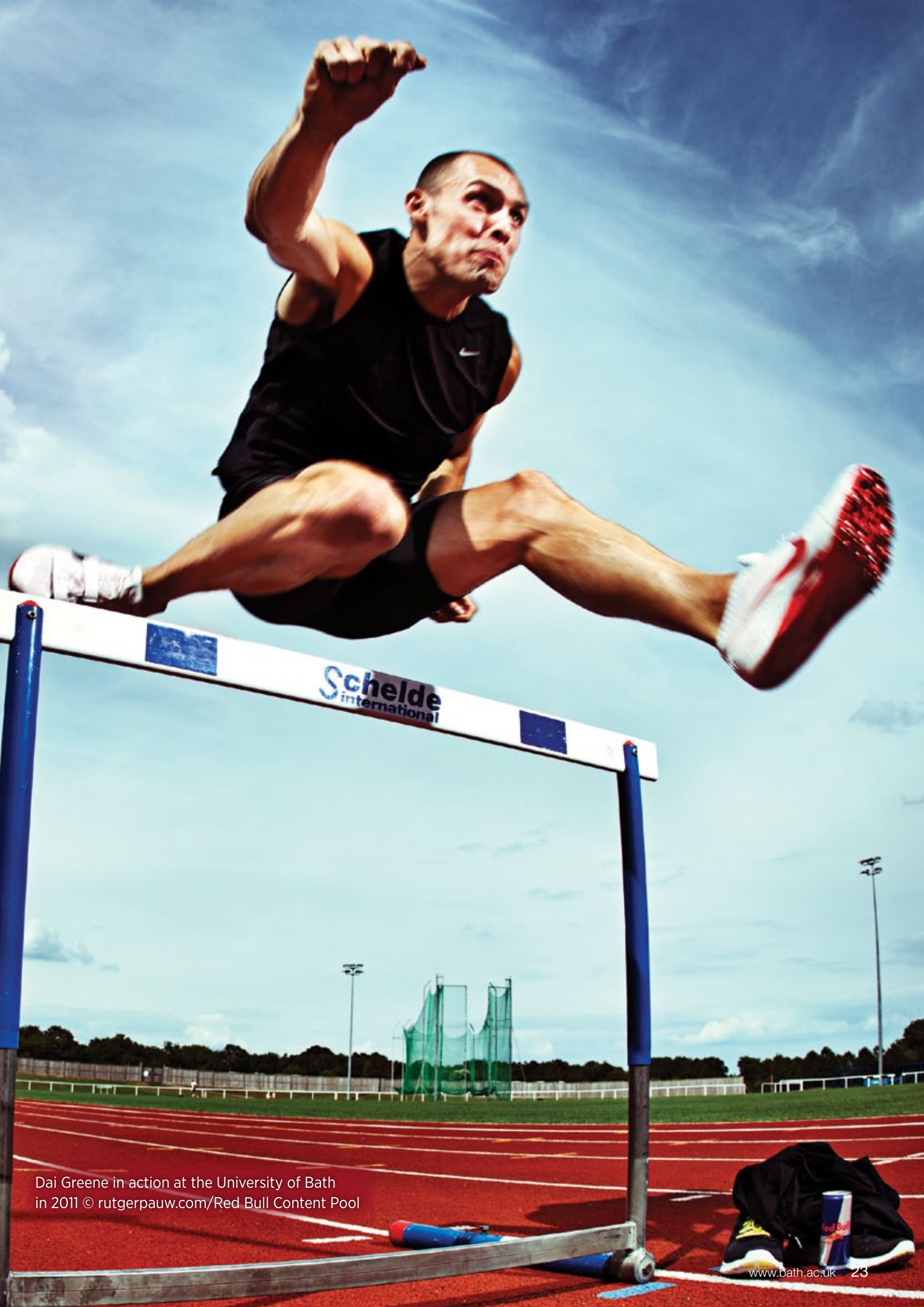
Dai Greene in action at the University of Bath in 2011