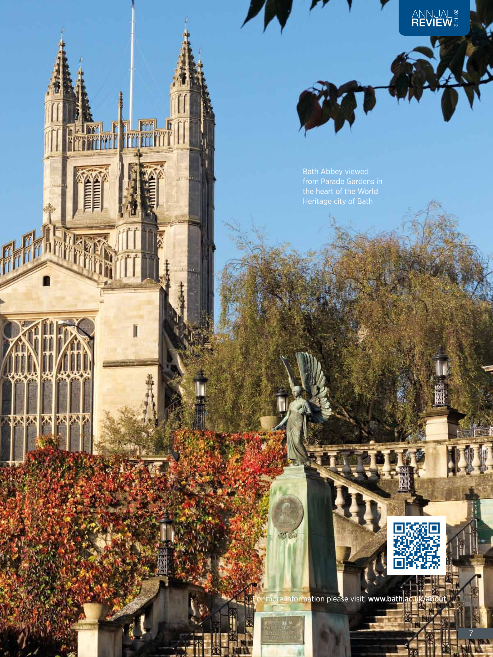
Bath Abbey viewed from Parade Gardens in the heart of the World Heritage city of Bath