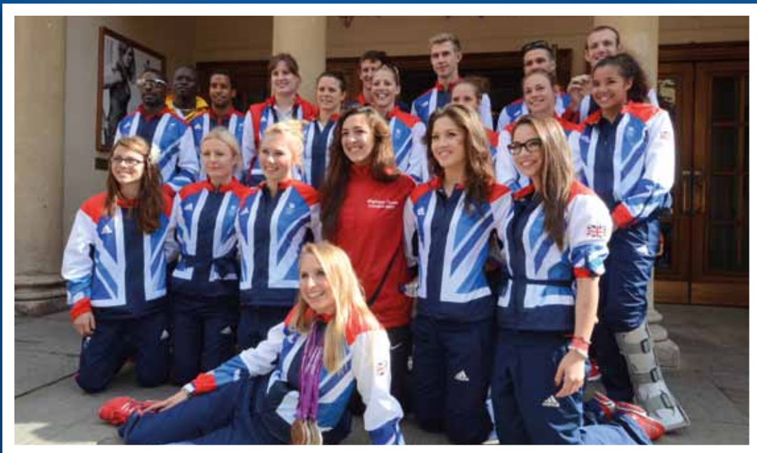
Above: Some of our Olympic and Paralympic heroes

Among them was Sports Technology graduate Heather Stanning and rowing partner Helen Glover who learned the sport at the GB Rowing Team's Start programme at Bath. The pair won Britain's first gold medal of the Games in the woman's pair event.