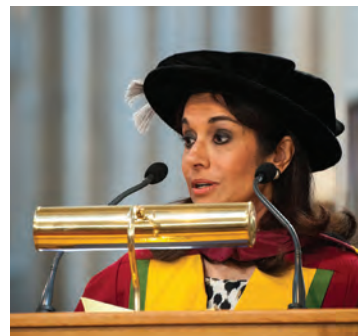
HRH Princess Sarvath El Hassan, a pioneering force in education whose influence and links with the University have transformed the opportunities available for young people within Jordan and throughout the region, was awarded an honorary degree (Doctor of Education) at this year's summer graduation ceremonies.

Finally, important internationalisation initiatives on campus have been promoted by the Students' Union and via our important partnership with the International Students' Association. These include intercultural training and campus-wide events, fostering the spirit of internationalism throughout the University community.